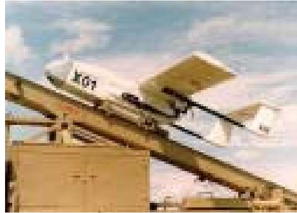
Fig. 2. SZOJKA-III. RS UAV [2]

The appearance of the autonomous flight capability, the increase of the aircraft size and its performance data (e.g. Wingspan \geq 5\text{m} , v_{\text{flight}} \geq 200 \text{ km/h} ) and the jet engine usage on the aircraft board finally take the unmanned flight a new foundation. With special regards the above mentioned fact it was desirable, such as the HDF and manufacturing companies too, in the controlled aircraft design, manufacturing and operating environment into.