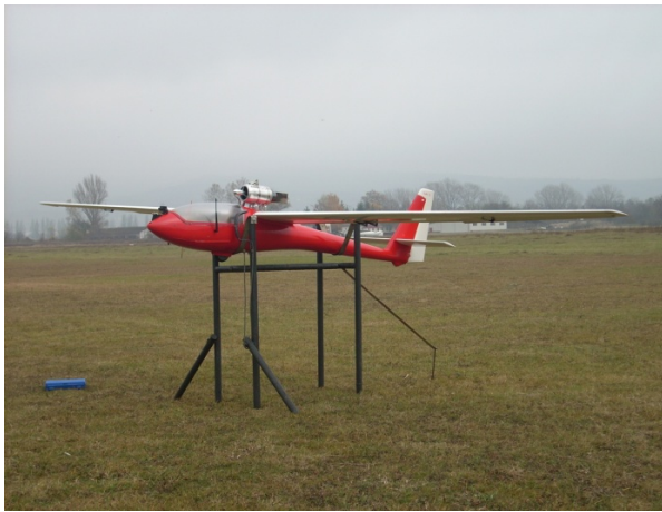
Fig. 1. METEOR-3MA TUAV [1]

These disadvantages and hazards in GPS-based flight control system were developed for the TUAVs, which have acquired an autonomous task execution, i.e. pre-stored flight plan is to fly along capability.