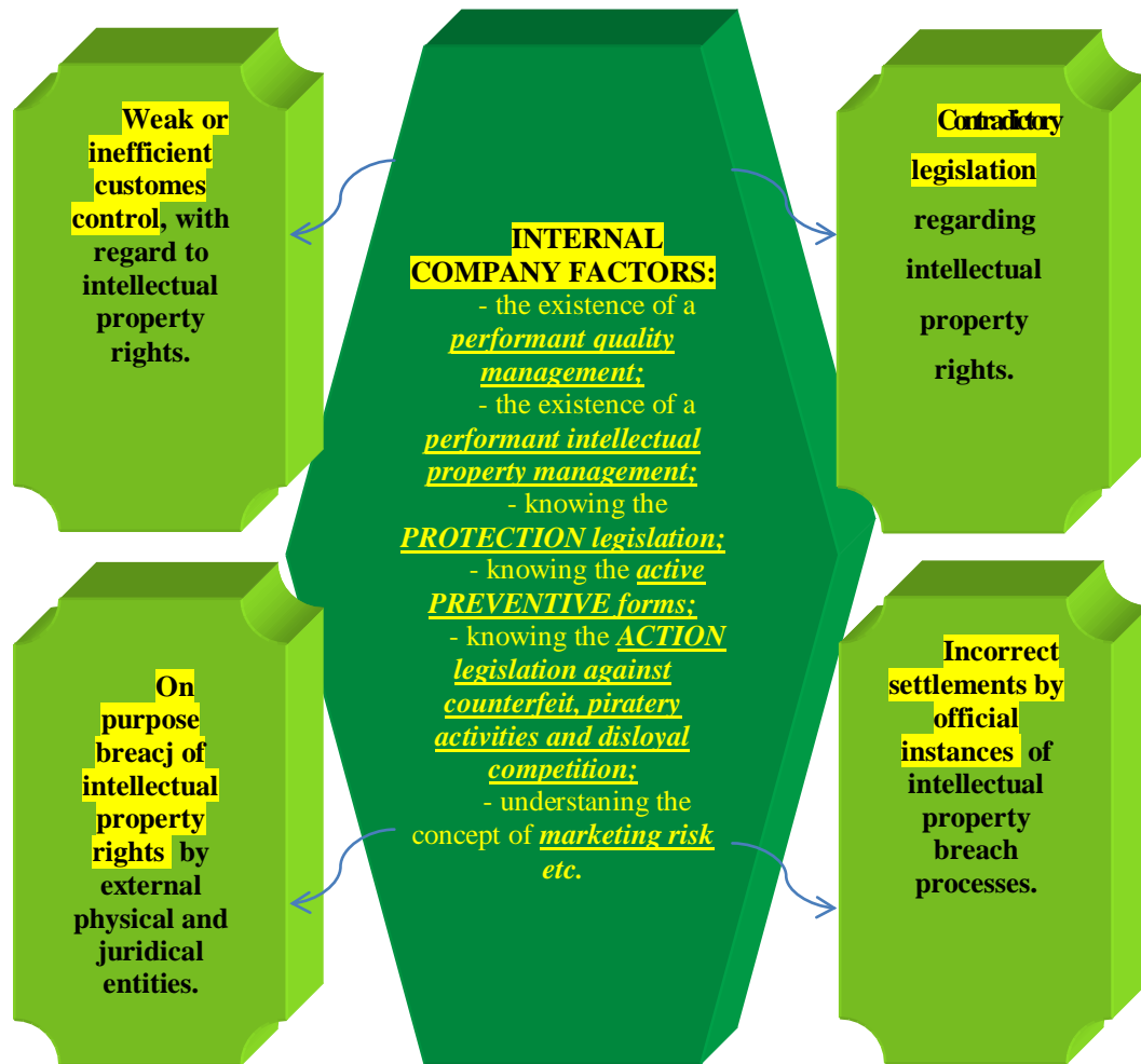
FIG. 1. The text “FIG. 1.”, Factors that can influence the actions against intellectual property rights breach. [12]