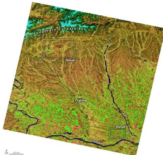
FIG.1 Acquired April 8, 2020[36]

In the past few decades, Romania's countryside has undergone significant changes in response to evolving land management policies and alterations in the natural environment. Consequently, numerous farms now exhibit a fascinating range of shapes and sizes, particularly when observed from an aerial perspective.