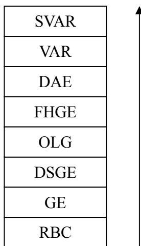
Figure 1. Pagan diagram concerning the choice of suitable macroeconomic model in relation to statistical data

OLG - overlapping generation models - is a model with infinite, calibrated time horizon;