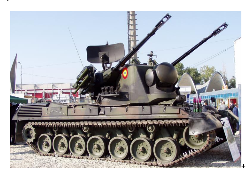
FIG. 2. The prototype of Gepard SPAAG - mixed VSHORAD at EXPOMIL 2011

The twin 35mm SPAAG Gepard is a good weapon for the mechanized units close support, mainly combined with a SHORAD.