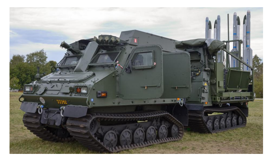
FIG. 4. IRIS-T AAM is directly used in SLS AD derivative -here the Swedish variant

Examples of such development are representing by surface-to-air systems based on the AIM-7 Sparrow, AIM-132 AMRAAM or IRIS-T missiles.