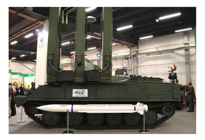
FIG. 3. The SA-6 have a certain up-grade potential - here the Polish variant w. RIM-162 ESSM

The SA-8 OSA is developed in little number, without real up-grade solutions and near end of the life-cycle.