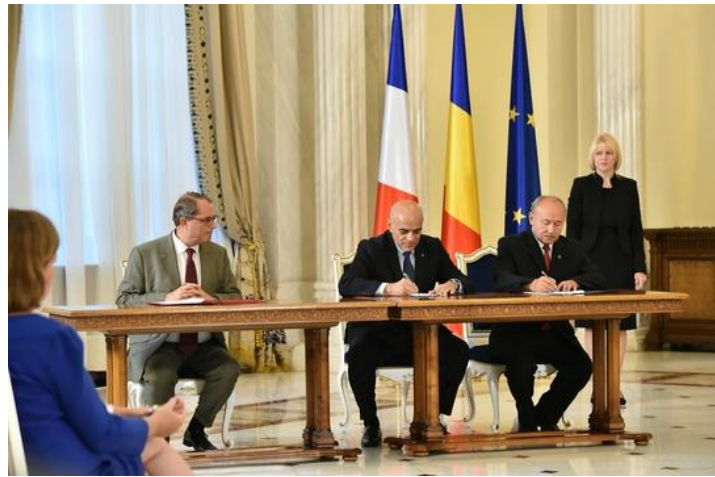
FIG. 2. Signing the MoU between the representatives of MBDA, ROMARM and SC Electromecanica Ploiesti SA[9]

The political establishment has began a daring program destined to increase the Romanian AD capability in the next 10-years period.