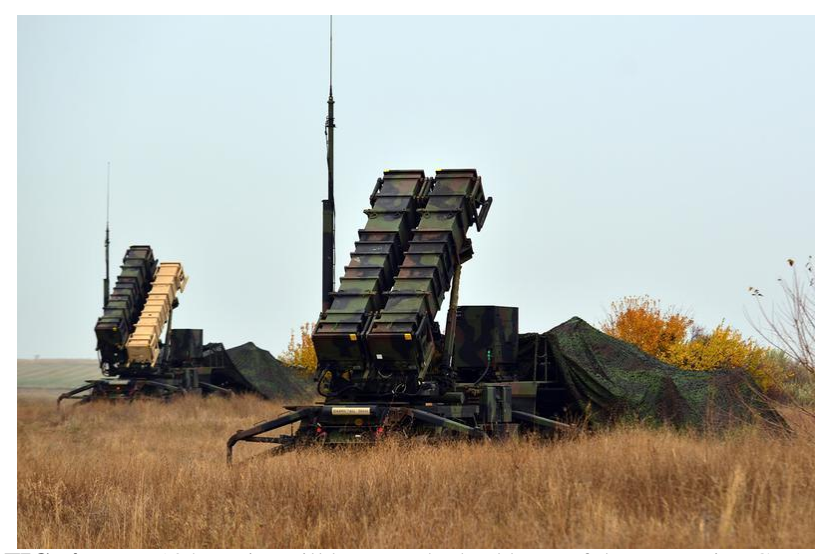
FIG. 4. MIM-104 Patriot will become the backbone of the Romanian GBAD

The necessary financial effort must cover also the available systems that can be upgraded, small AD weapons, the AD capability of the Fleet (2 frigates and 4 corvettes in short time), continuously improve of the C3I network, maintenance and some support facilities for the strengthening NATO units.