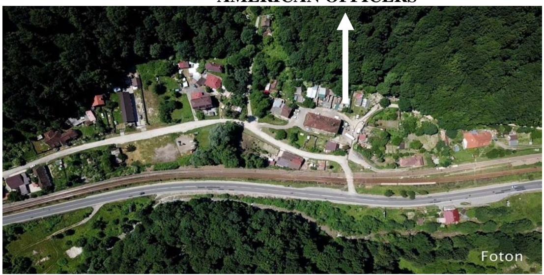
FIG. 4 The right side of the Timişu de Jos camp seen with a drone

In the following image you can see more closely the building in which the American officers were imprisoned. At that time it was a fairly modern, storey building, with less accommodation than the building where the American non-commissioned officers lived.