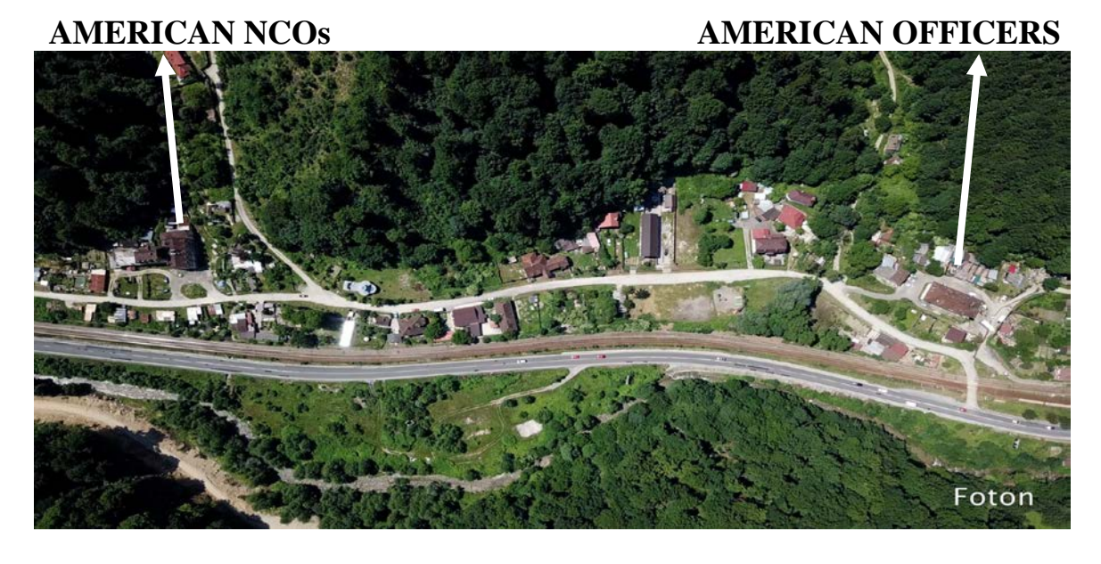
FIG. 3. The left side of the Timişu de Jos camp seen with a drone.

Due to the fact that Timişu de Jos is so close to the city of Braşov, where I studied, I had the opportunity to go to the old prison camp and to see, more closely, the way the buildings were located and their current condition. To present the study done in the field, I will present in the following pages some pictures taken with the drone.