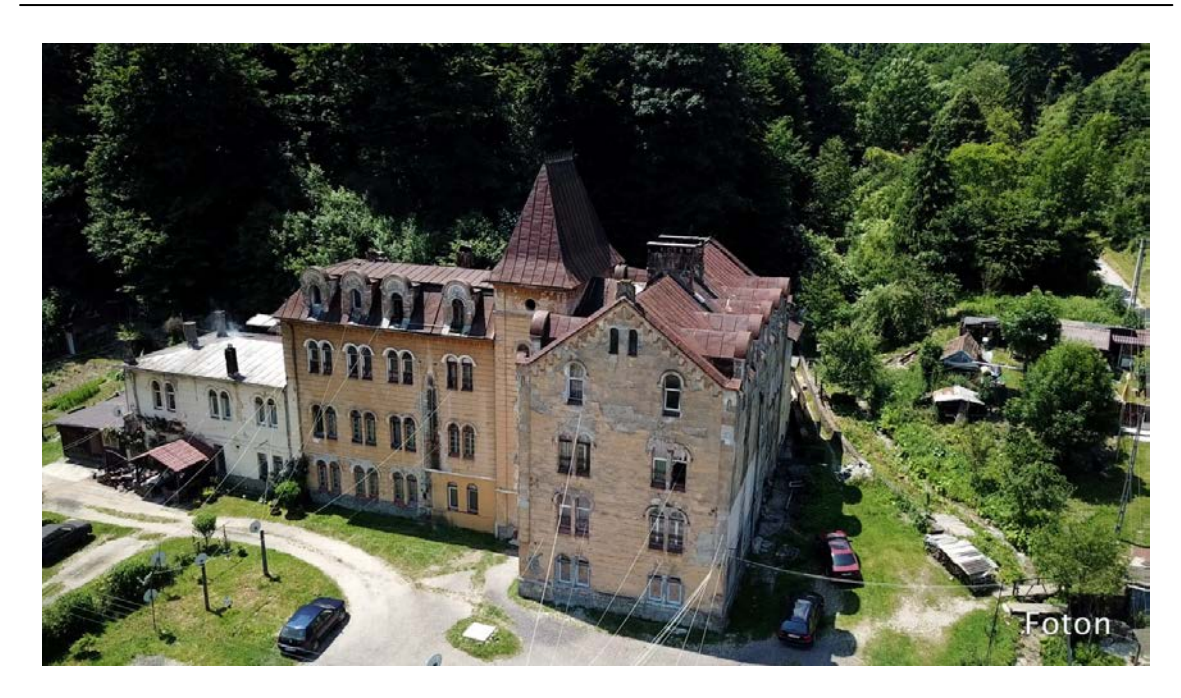
FIG. 6 The building where the American non-commissioned officers lived