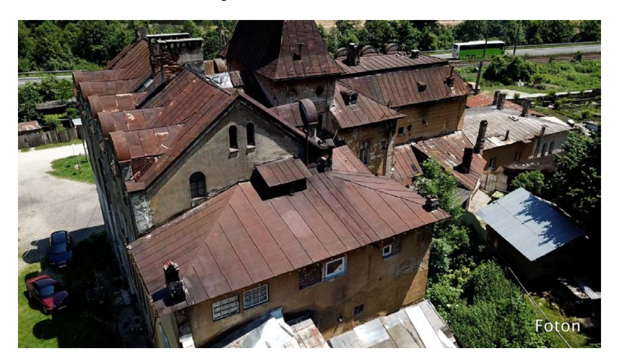
FIG. 7 The back of the building where the American non-commissioned officers lived