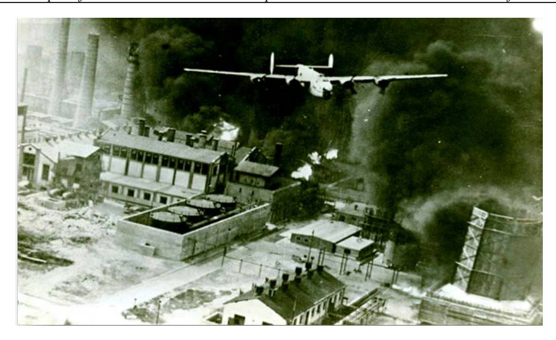
FIG. 1 The refineries in Ploiești under attack

When the 15th Air Force was established in Italy, the bombing planes returned over Romania starting with April 1944 [6]. Then, however, the oil fields were within range of fighter jets. More than 5,400 heavy bombers, along with almost 4,000 fighter jets, targeted Ploeşti, turning it into ash. The missions ceased when the Soviet army moved to the area in August 1944. More than 2,800 airmen were wounded or killed in an effort to stop the Nazi fuel source.