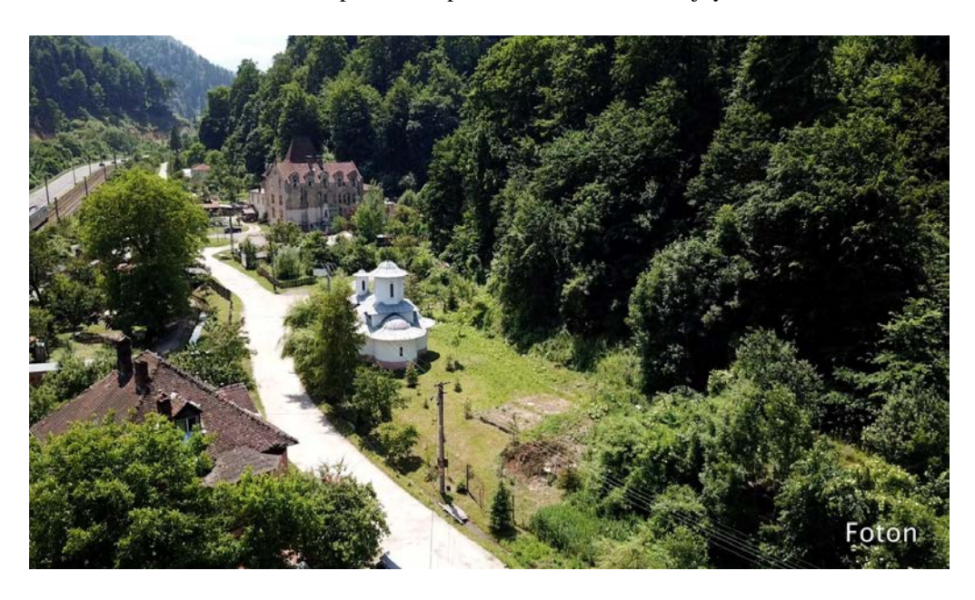
FIG. 9 The church near the building where the non-commissioned officers lived