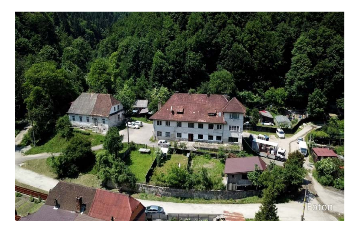
FIG. 5. The building in which the American officers were imprisoned

In the following image you can see more closely the building in which the American officers were imprisoned. At that time it was a fairly modern, storey building, with less accommodation than the building where the American non-commissioned officers lived.