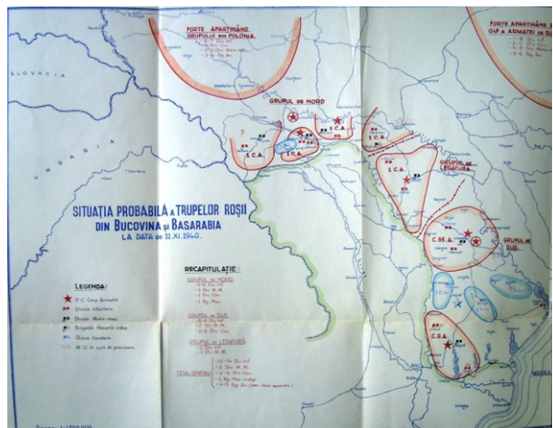
Sketch 3 Sketch 4

At the same date, a large and well-documented material was presented, named "Information Synthesis on USSR Aeronautics", divided into commands (deployment and names of commanders) and units, which are structured on the military districts of European Russia and Asian Russia. In the European part, six air corps and 34 independent aviation brigades were identified, totaling 6,500 aircraft (2,500 for hunting and assault, 2,000 for bombing and 2,000 for observations and information). Of these, 900 were deployed in Basarabia and northern Bukovina, attesting to the Soviet leadership's interest in the region. Two air forces and 15 independent brigades were stationed in Asian Russia, totaling 3,000 planes.