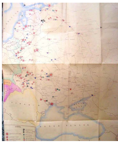
Sketch 5 Sketch 6