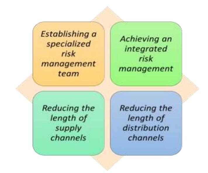
FIG. 4 Current crisis management solutions in times of crisis

As stated above, the objective-risk correlation needs to be redefined, at least for a short period of time, so that managerial decisions can continue to ensure the proper functioning of the organization. " Strategic risk management is really about preparing for the worst but hoping for the best. " [3] This statement would be realistic if we were in a normal situation, but the current context cannot be included in this category, so I consider that the long-term approach to the issue of risks is very dangerous.