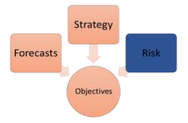
FIG. 1 Risk - an essential component of the objectives achievement process

Normally, a realistic managerial "construction" is based on the correctness of forecasts across the spectrum of areas of the environment, so that the managerial strategy - the essential component of a successful management process – will be easy to apply, track and achieve. But a lot of forecasts, both in number and in structure and value, had to be updated at time intervals on more and more short. This phenomenon can put us in the situation of asking ourselves: "how much of the adopted strategy can be implemented and when do we need to change it?" The difference between the predictable value of the forecasts and the actual result obtained is determined by the risk management at the level of each organization. I believe that the delimitation and association of their importance in the current approach to the development of all activities.